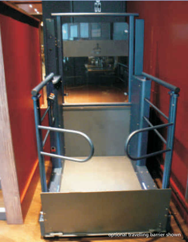
optional travelling barrier shown