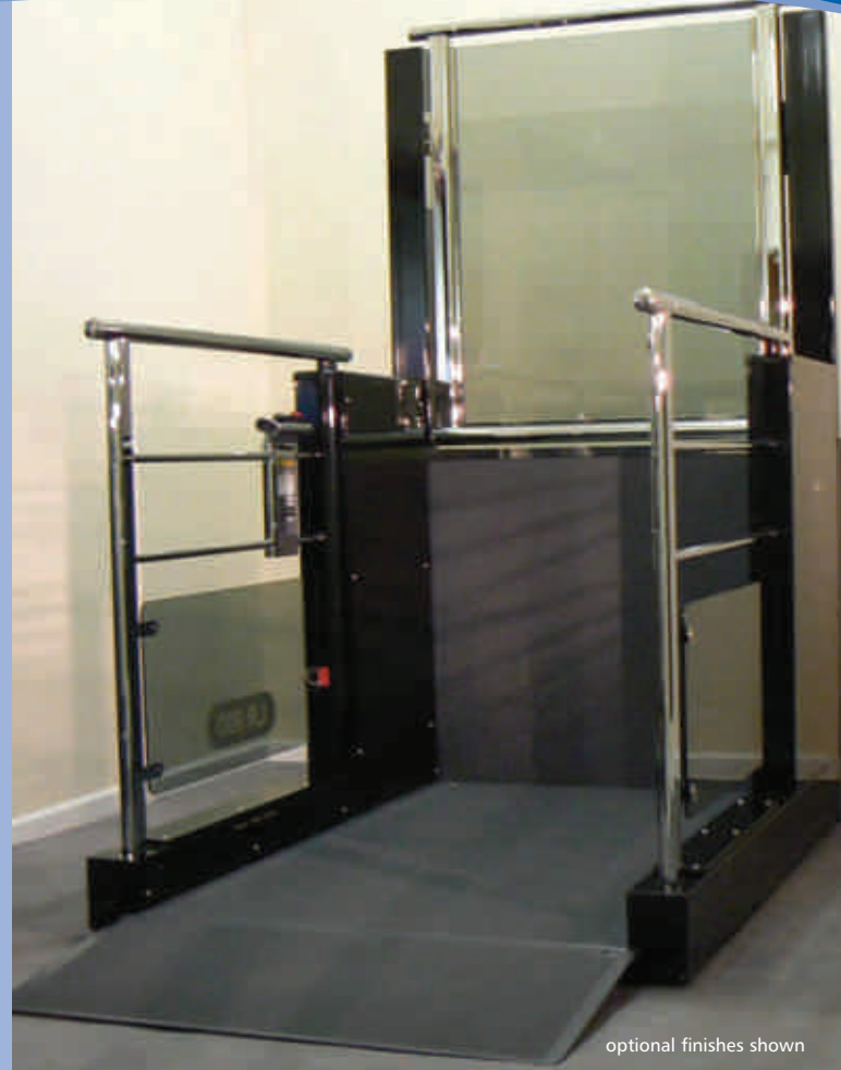
optional finishes shown